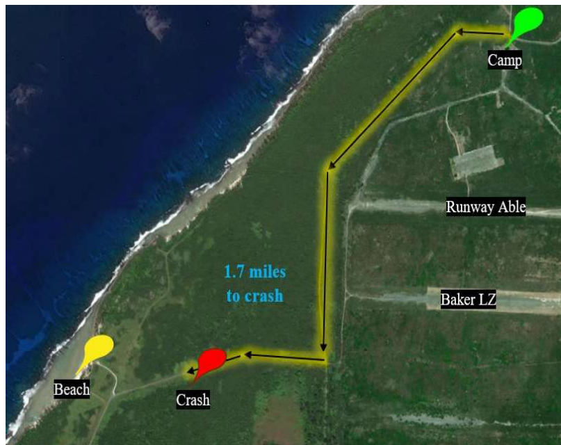
Figure 3: Highlighted area showing camp site, MV route towards Chulu Beach, and mishap site (Tab Z-4)