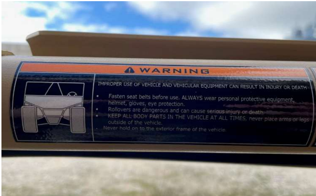
Figure 10: Warning label above steering wheel: “Fasten seatbelts before use. ALWAYS wear personal protective equipment, helmet, gloves, eye protection” (Tab S-202)