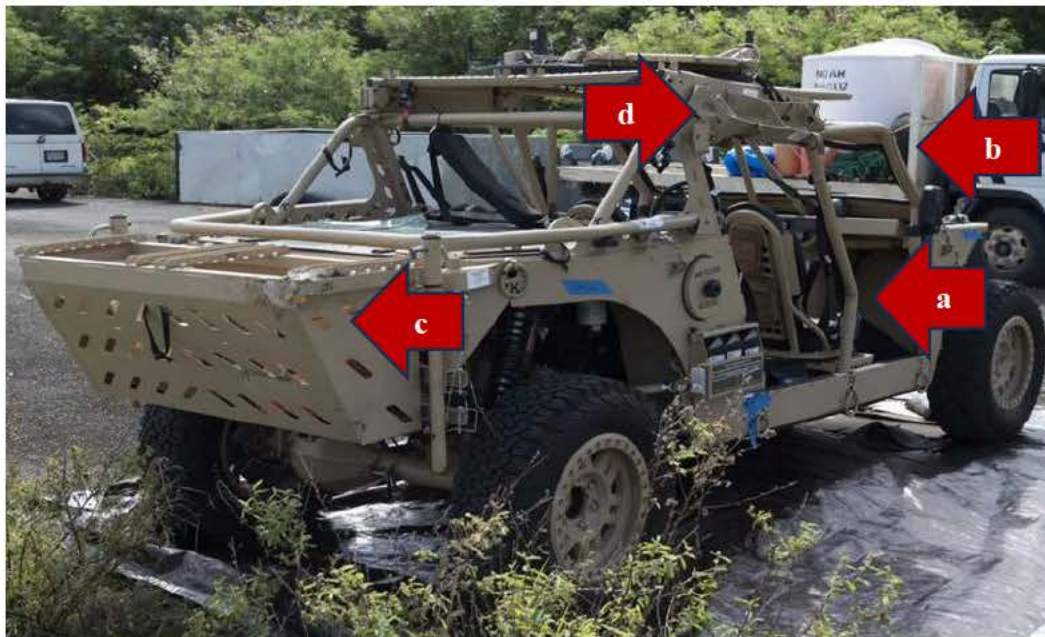
Figure 14: (a) Bent roll cage by passenger seat, (b) Bent windshield frame, (c) Damage to cargo bin on rear passenger side, (d) Crushed bins on passenger side roof (Tab S-142)