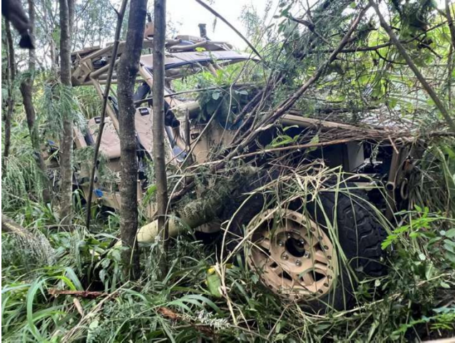
Figure 6: Passenger side of MV at mishap site (Tab S-172)