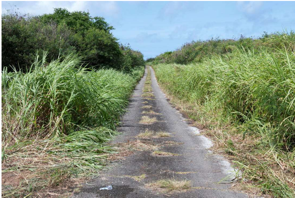
Figure 17 - Unnamed Road Where Mishap Occurred (Tab S-13)

The unnamed single-lane road where the incident occurred connects Lennox Road and Riverside Road on the western edge of North Field and the terrain is generally flat (Tabs V-5.3, Z-4 to Z-6).