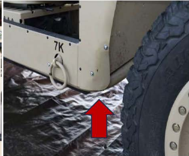
Figure 13: Passenger side wheel well damage (Tab S-69)