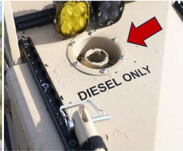
Figure 16: Missing diesel fuel cap on the passenger side hood (Tab S-88)