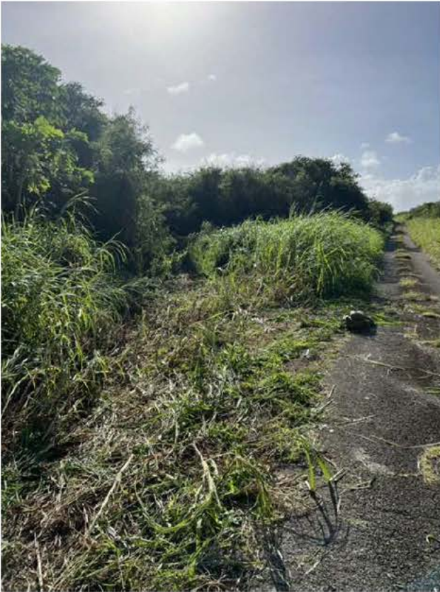
Figure 4: Vegetation flattened by MV after departing road (view - direction of travel) (Tab S-150)

The MV departed the road to the left and entered the thick vegetation (Tabs R-77, R-97, and V-4.9). The MV completed a counterclockwise right leading rollover, coming to rest back on its tires against trees more than 30 feet from the road (Tabs R-77, R-97, O-4, and V-5.4.). Neither MA1 nor MA2 were wearing seatbelts or other personal protective equipment (Tabs V-3.6 and V-8.4 to V-8.5). MA1 was ejected from the MV and sustained serious injuries, resulting in permanent paralysis below the waist (Tabs V-4.9 and Tab X-4). MA2 was ejected from the MV (Tabs V-3.6 and V-8.6). During the rollover and after ejection, the MV struck MA2 causing life-threatening injuries to include a pelvic fracture and internal abdominal injuries, which has resulted in numerous corrective surgeries and an above-the-knee amputation (Tabs V-8.7 and Tab X-5 to X-6).