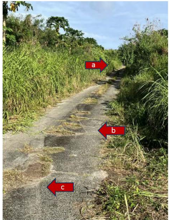
Figure 5: (a) Road narrowed by vegetation overgrowth, (b) and (c) MV tire marks departing road (view - opposite direction of travel) (Tab S-158)