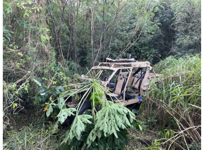
Figure 7: Driver side of MV at mishap site (Tab S-189)