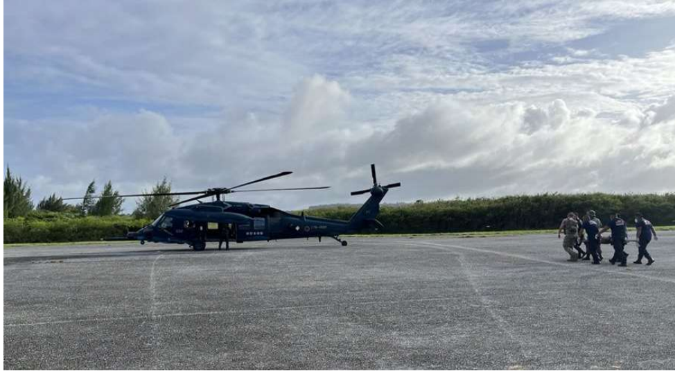
Figure 8: First responders moving MA1 to JASDF UH-60J (Tab S-185)