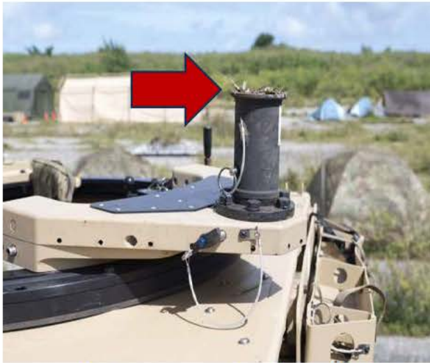
Figure 15: Turret mount packed with dirt and vegetation on roof of the driver side (Tab S-136)