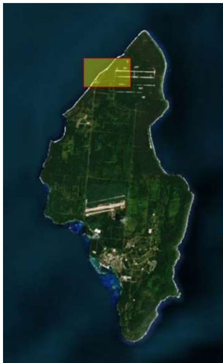
Figure 2: Map of Tinian with mishap site highlighted (Tab Z-3)