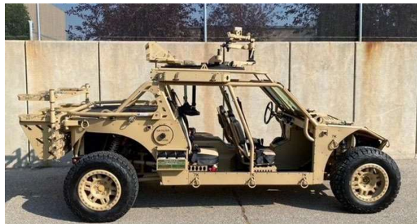
Figure 1 – SRTV-SXV (Tab O-8)

The SRTV-SXV is a commercial off-the-shelf, diesel-powered, all terrain tactical vehicle used to transport Guardian Angel personnel (Tab BB-75). It is tailorable with multiple configurations and transportable on the V-22 Osprey and airdrop capable from C-130 aircraft (Tab BB-75). It can accommodate a six-person crew or transport up to four litters (Tab BB-75). The SRTV-SXV in this mishap is S/N SRTVSXVD21AFM060 and was manufactured in 2021 (Tab S-91).