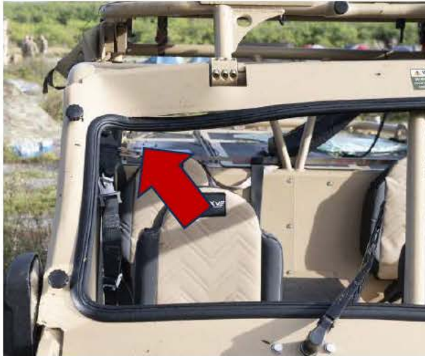
Figure 12: Missing passenger side windshield and bent frame (Tab S-73)