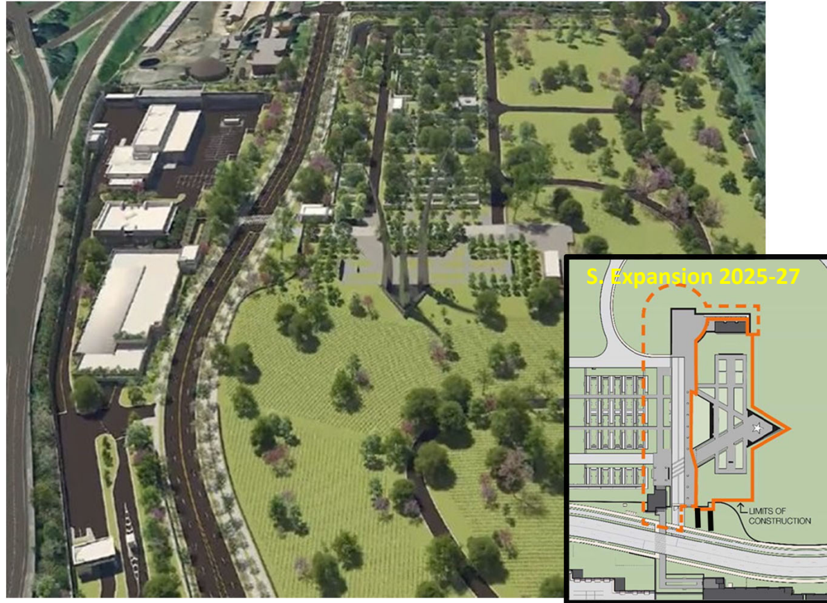
Above graphic shows rendering of final design